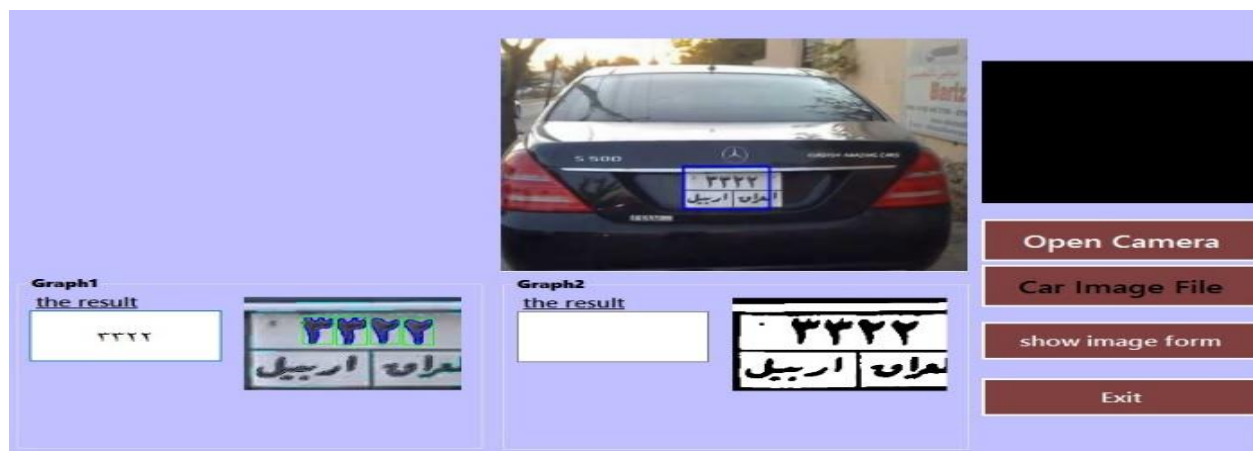
Figure2.0: Determine the plate and identifying the number

3.2.2. Identifying and extraction of the license plate. Using the sub-image from the last step that contains the license plate with some extra parts, the following processing is applied to this sub-image. The license plate may be skewed because of the angle of the camera while image acquisition process and it is very important to de-skew the plate to its original orientation, thus making the plate aligned with the X and Y-axes. [8], [1][12]. After that, the plate has aligned with X and Y axes. Later, a Gaussian smoothing filter is applied to smooth the image and remove noise. Then a morphological operation will be conducted which consists of subtracting the bottom-hat of the image from the image itself is done using a structuring element of a horizontal line [7].