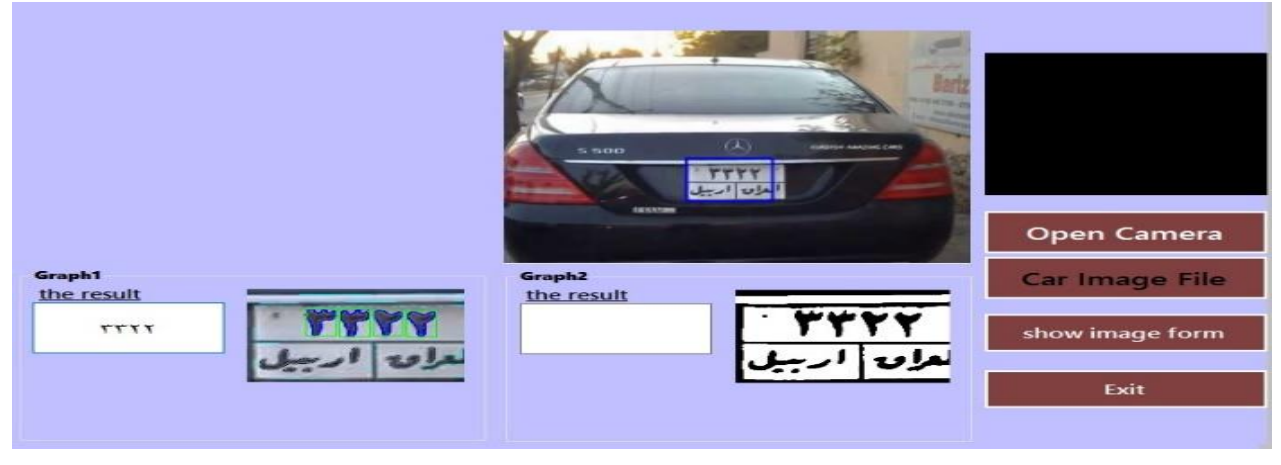
Figure 2.0: Determine the plate and identifying the number

3.2.2. Identifying and extraction of the license plate . Using the sub-image from the last step that contains the license plate with some extra parts, the following processing is applied to this sub-image. The license plate may be skewed because of the angle of the camera while image acquisition process and it is very important to de-skew the plate to its original orientation, thus making the plate aligned with the X and Y-axes. [8], [1][12]. After that, the plate has aligned with X and Y axes. Later, a Gaussian smoothing filter is applied to smooth the image and remove noise. Then a morphological operation will be conducted which consists of subtracting the bottom-hat of the image from the image itself is done using a structuring element of a horizontal line [7].