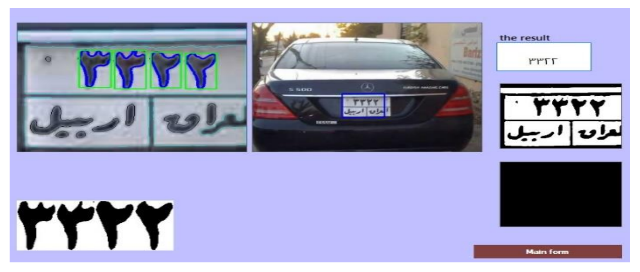
Figure 3.0: Character segmentation and recognition

All the dll files imported into visual studio 2015 so the neural network is conducted inside this dll files [8][5]. The image is converted to black and white to be easily distinguish characters and extracted.